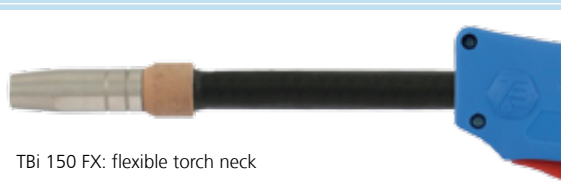
TBI 150 FX: flexible torch neck